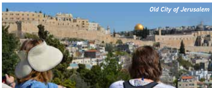
Old City of Jerusalem