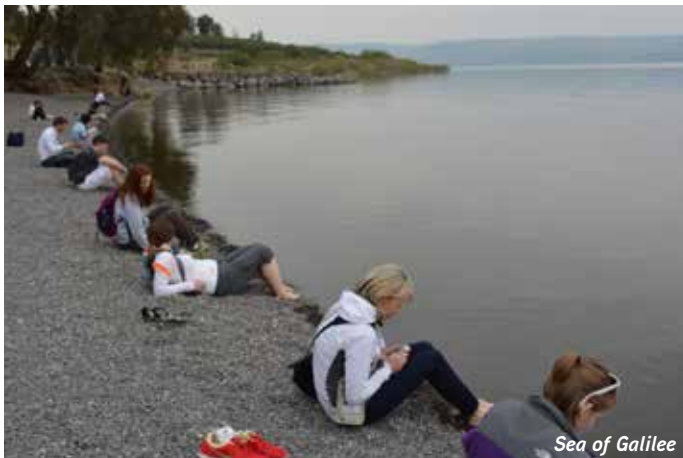
Sea of Galilee