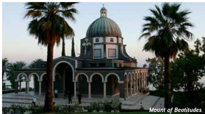
Mount of Beatitudes

This morning visit the Tomb of Maimonides followed by a stop in the ancient center of Jewish mysticism - Safed. The narrow cobblestone alleys reveal artists’ galleries, medieval synagogues, private homes and small guest houses. We will tour one of the medieval synagogues, then make a short stop in Chorazin, one of the three towns cursed by Our Lord for their lack of faith (Lk. 10). Later, ascend the Golan Heights and stop at the Banias Spring that rises from under a cave and is one of the sources of the Jordan River. It was here, the ancient Caesarea Philippi, where after Peter made his confession of faith, Jesus said “You are Peter, and on this rock I will build my church.” (Mt. 16) On our return to Tiberias we will travel around the Sea of Galilee and stop at Kursi. Here Jesus met a possessed man and miraculously cast out a legion of demons into the herd of swine (Lk. 8:26).