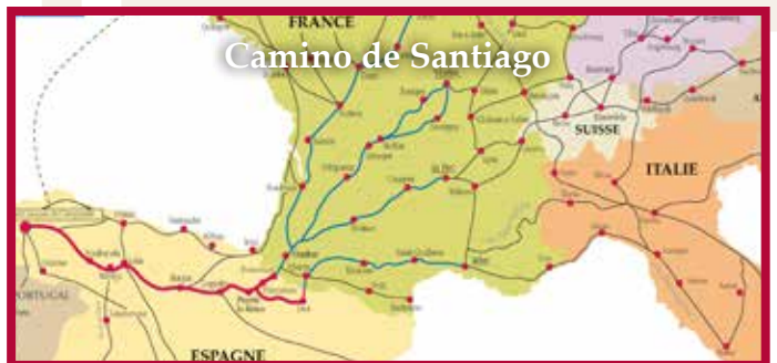
Camino de Santiago

Depart Fatima this morning and drive north to Porto where we will visit the soaring Cathedral and admire the richly decorated Church of Sao Francisco. Then proceed to Braga which contains over 300 churches and is the religious center of Portugal. Our sightseeing here will include visits to Braga's Sé Cathedral which is the oldest in Portugal and the Bom Jesus do Monte which is an important pilgrimage shrine. Then continue on to Santiago de Compostela. Tradition tells us that St. James the Apostle journeyed to Spain in 40 A.D. to spread the Gospel as far as possible. He died a martyr's death after returning to Jerusalem and his remains were eventually returned to Spain and buried in this city.