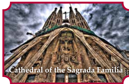
Cathedral of the Sagrada Família

we will participate in the Blessed Sacrament Procession and the Candlelight Procession.