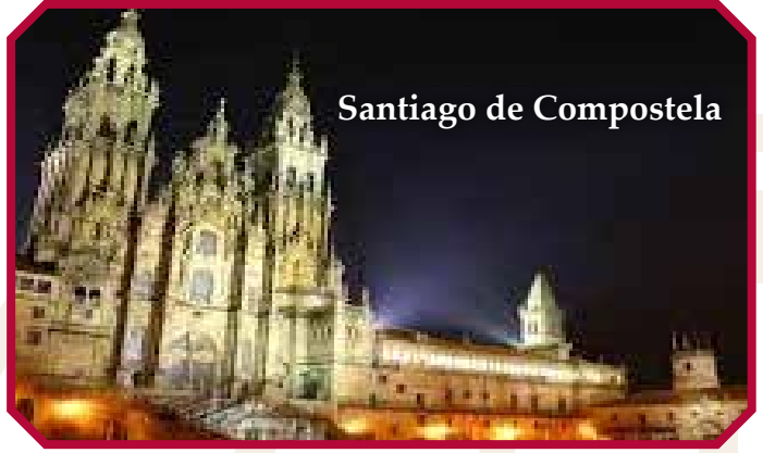
Santiago de Compostela

faith in Fatima. It was here that the three children were baptized and Lucy made her first confession at six years of age. The kindly priest who heard her confession told her to consecrate herself to the Blessed Virgin and she immediately did this in front of the statue of Our Lady of the Rosary. The following day she took Holy Communion for the first time. Jacinta also frequently came here to pray. Once on the feast of the Ascension, the Blessed Virgin appeared and asked them to pray the rosary every day and ask for world peace. After Mass at the Chapel of the Apparitions, visit the Basilica to see the site of Francisco and Jacinta's graves and the village where the three children lived. Continue to Valinhos where Our Lady appeared to the children following their release. This evening participate in the Stations of the Cross along the Via Sacre, site of the first Apparition.