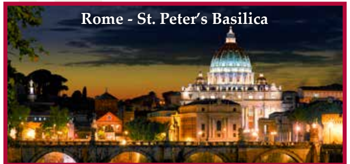
Rome - St. Peter's Basilica