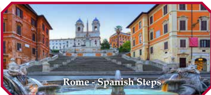
Rome - Spanish Steps

Today marks the end of our profound spiritual journey as you board your flight for the trip home.