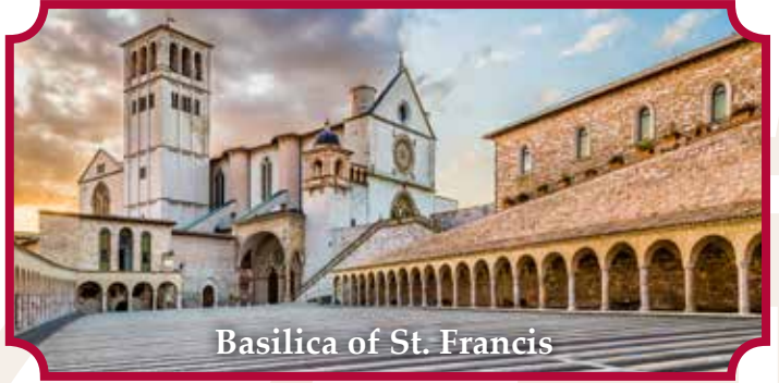
Basilica of St. Francis

Today we transition from Siena to the peaceful home of our patron, St. Francis. On the journey, we will