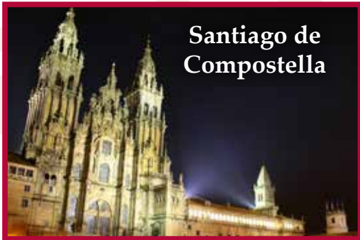
Santiago de Compostella