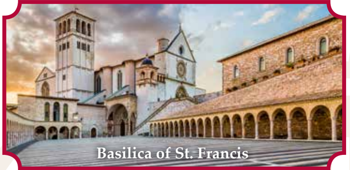
Basilica of St. Francis

This morning we will visit St. Mary of the Angels