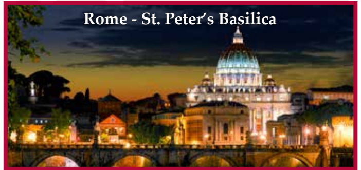
Rome - St. Peter's Basilica