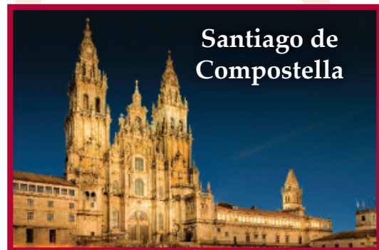
Santiago de Compostela

Walk on natural pathways with good shade offered by trees. The Camino now becomes busier with pilgrims as we near the fabled city of Santiago.