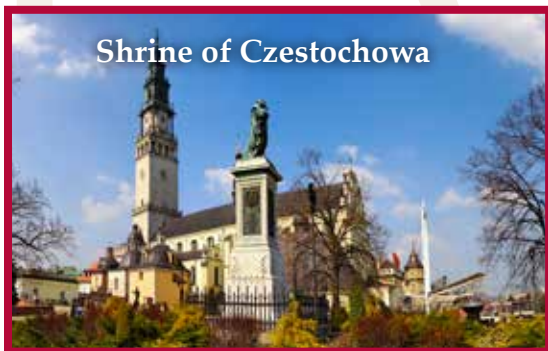
Shrine of Czestochowa

Shrine in Lagiewniki, where Saint Faustina, the Apostle of Divine Mercy, lived and died. Enjoy a guided tour of the shrine and celebrate Mass at the Chapel of Relics. Then drive to the Wieliczka to visit Europe's oldest salt mine which has been listed by UNESCO as a World Heritage Site. The mines are a unique place where many generations of Polish miners have created a world of underground chambers and decorated chapels carved out of salt including the famous Chapel of St. Kinga. Return to Krakow with the remainder of the day free.