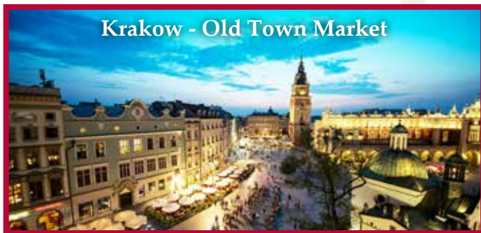
Krakow - Old Town Market

This morning we will celebrate Mass at the Shrine of Our Lady of Fatima in Krzeptowki which was built by the mountaineers in gratitude for the Blessed Mother saving