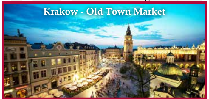
Krakow - Old Town Market