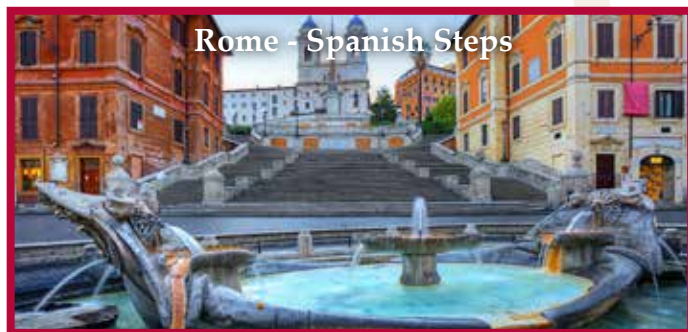
Rome - Spanish Steps

This morning we will experience a highlight of our pilgrimage, attendance at the Papal Audience at St. Peter's (subject to the Holy Father's schedule). Join thousands of pilgrims from throughout the world to listen to the Holy Father and receive his blessing. Next we'll head to the Mamertine Prison where St. Paul was kept in chains, view the Forum (outside visit) and Coliseum and stop at St. Clement's, to see the second century dwelling of Pope St.