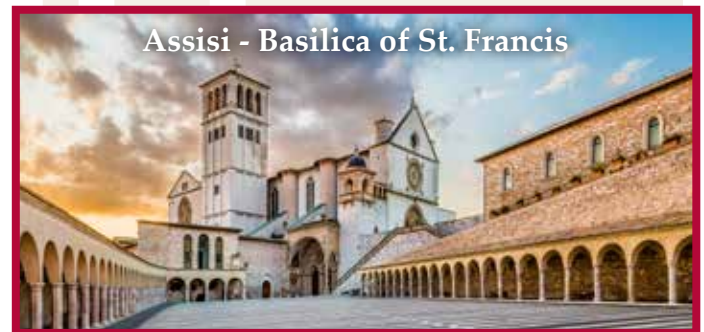
Assisi - Basilica of St. Francis