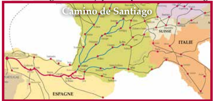
Camino de Santiago

de Compostela. Visit the impressive Cathedral which is considered to be one of the finest pieces of architecture in Europe. After Mass, climb up the stairs behind the altar to visit the crypt, where a silver urn contains the relics of St. James. See the Portico de la Gloria (Gateway to Heaven), an unparalleled masterpiece. Walk to the top of the Cathedral for a panoramic view of this glorious city. We will also visit the museum in the cloister adjoining the Cathedral. (Option: For those with the stamina you can walk the last 9 miles of the Camino on your own today taking in the pilgrimage of all those who have travelled on the Camino for centuries.)